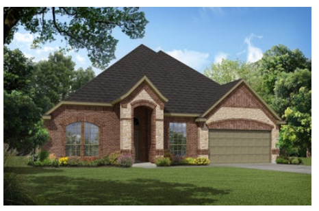
2622 A with Stone