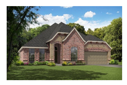
2622 B with Stone