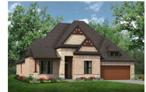
2622 E with Stone