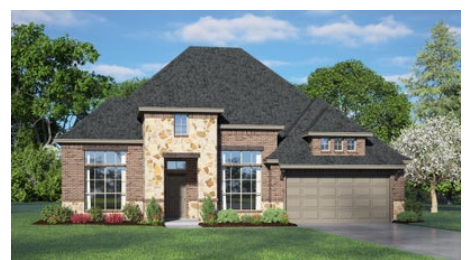
2622 C with Stone