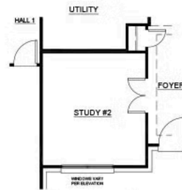
OPT. STUDY ILO DINING