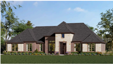
2406 B with Stone