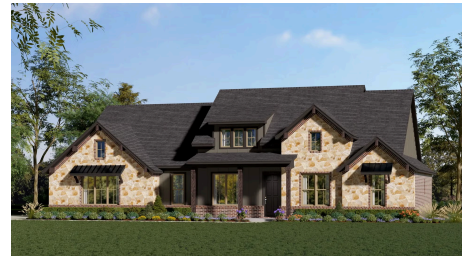
2406 C with Stone