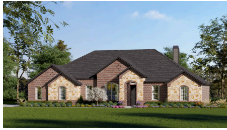
2406 A with Stone