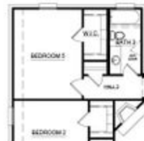
OPT. BEDROOM #5 w/ BATH #3 ILO FLEX ROOM w/ POWDER