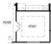
OPT. STUDY ILO DINING