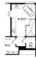
OPT. LUXURY MASTER BATHROOM

In a continuing effort to improve our products and communities, Antares Homes may (in its sole and exclusive discretion and without creating any obligation or notice) abandon, change, or otherwise modify plans, pricing, included features, home site availability, terms, etc. All images, renderings, dimensions, depictions or descriptions of home designs and layouts being offered are for representational and informational purposes only and may vary from the homes being built or completed improvements. All dimensions and designs are subject to field variations and modifications. © 2021 Antares Homes.