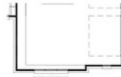
3RD CAR GARAGE OPT. "A"