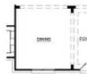
OPT. DINING ILO BEDROOM #4