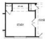
OPT. STUDY ILO BEDROOM #4