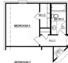
OPT. BEDROOM #5 w/ BATH #3 ILO FLEX ROOM w/ POWDER