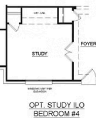
OPT. STUDY ILO BEDROOM #4