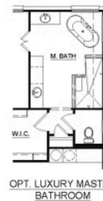
OPT. LUXURY MASTER BATHROOM

In a continuing effort to improve our products and communities, Antares Homes may (in its sole and exclusive discretion and without creating any obligation or notice) abandon, change, or otherwise modify plans, pricing, included features, home site availability, terms, etc. All images, renderings, dimensions, depictions or descriptions of home designs and layouts being offered are for representational and informational purposes only and may vary from the homes being built or completed improvements. All dimensions and designs are subject to field variations and modifications. © 2022 Antares Homes.