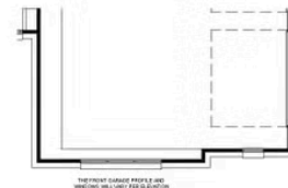
3RD CAR GARAGE