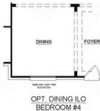
OPT. DINING ILO BEDROOM #4