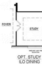
OPT. STUDY ILO DINING