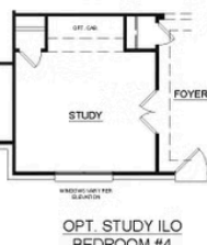
OPT. STUDY ILO BEDROOM #4