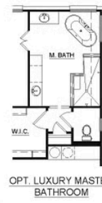
OPT. LUXURY MASTER BATHROOM

In a continuing effort to improve our products and communities, Antares Homes may (in its sole and exclusive discretion and without creating any obligation or notice) abandon, change, or otherwise modify plans, pricing, included features, home site availability, terms, etc. All images, renderings, dimensions, depictions or descriptions of home designs and layouts being offered are for representational and informational purposes only and may vary from the homes being built or completed improvements. All dimensions and designs are subject to field variations and modifications. © 2022 Antares Homes.