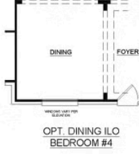
OPT. DINING ILO BEDROOM #4