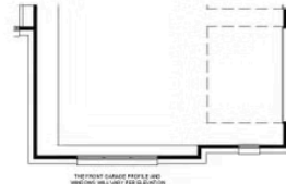
3RD CAR GARAGE