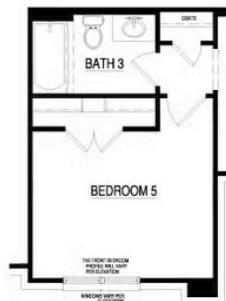
OPT. BEDROOM 5 ILO STUDY