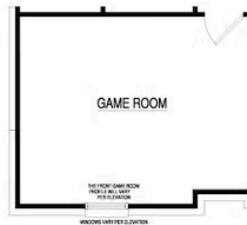
OPT. GAME ROOM ILO BEDROOM 4