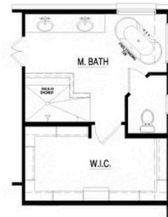
OPT. LUXURY BATH

In a continuing effort to improve our products and communities, Antares Homes may (in its sole and exclusive discretion and without creating any obligation or notice) abandon, change, or otherwise modify plans, pricing, included features, home site availability, terms, etc. All images, renderings, dimensions, depictions or descriptions of home designs and layouts being offered are for representational and informational purposes only and may vary from the homes being built or completed improvements. All dimensions and designs are subject to field variations and modifications. © 2020 Antares Homes.