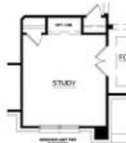
OPT. STUDY I/O BEDROOM #4