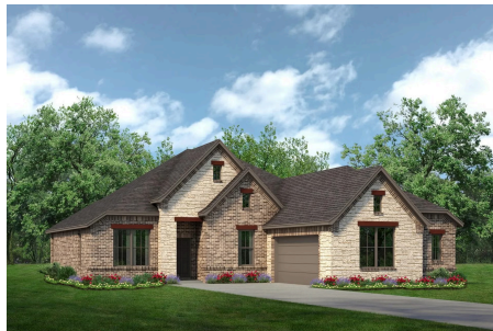
2267 D with Stone