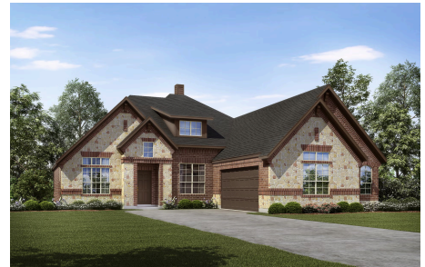
2267 C with Stone