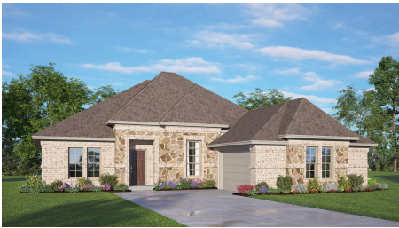
2267 B with Stone