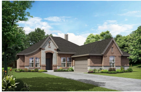
2267 A with Stone