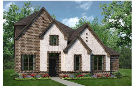
2795 C with Stone