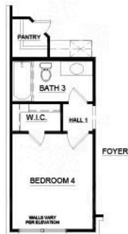
OPT. BEDROOM 4 W/ BATH 3 ILO FLEX ROOM W/ POWDER