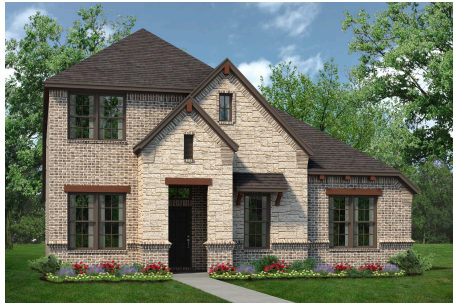
2795 B with Stone