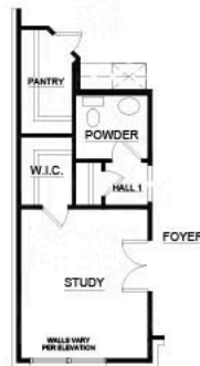
OPT. STUDY ILO FLEX ROOM