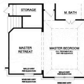
OPT. MASTER RETREAT ILO DINING