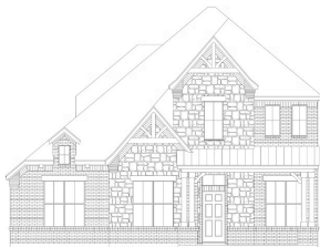
2795 RF-D with Stone