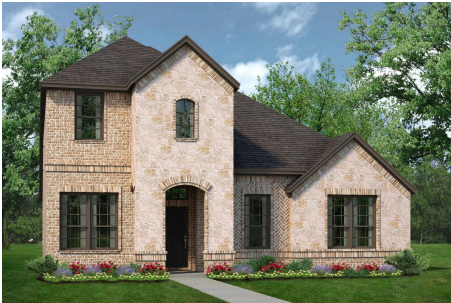
2795 A with Stone