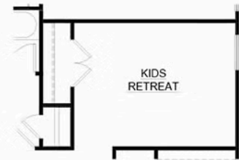
OPT. KID'S RETREAT ILO BEDROOM 2