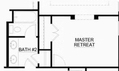
OPT. MASTER RETREAT ILO BEDROOM 2