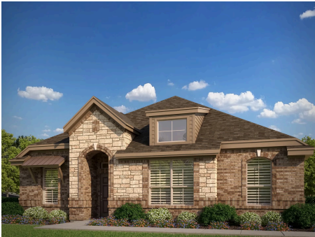
2129 B with Stone