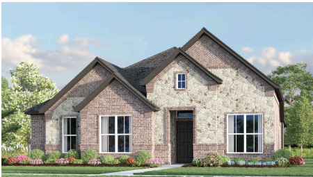
2129 G with Stone