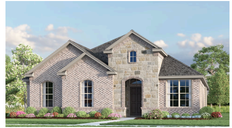
2129 F with Stone