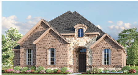
2129 H with Stone