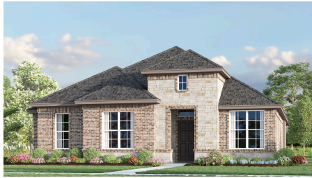
2129 E with Stone