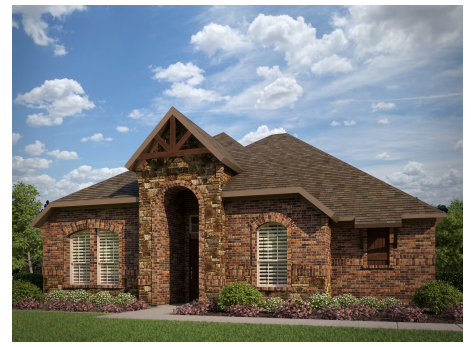
1802 B with Stone