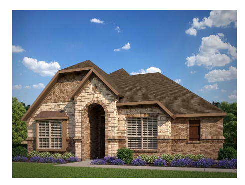
1802 C with Stone