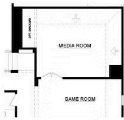
OPT. MEDIA ROOM