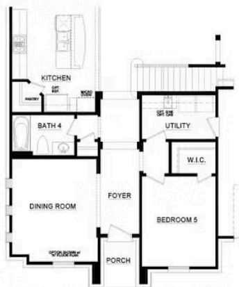
OPT. 5TH BEDROOM / BATH 4 ILO STUDY