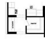
OPT. REF. LOCATION