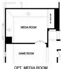
OPT. MEDIA ROOM