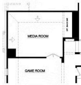
OPT. MEDIA ROOM