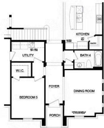
OPT. 5TH BEDROOM / BATH 4 I/O STUDY