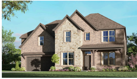
3135 B with Stone