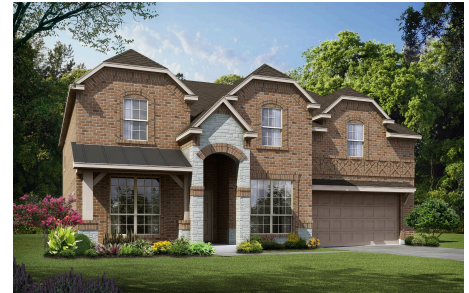
3135 C with Stone