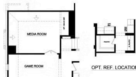
OPT. MEDIA ROOM