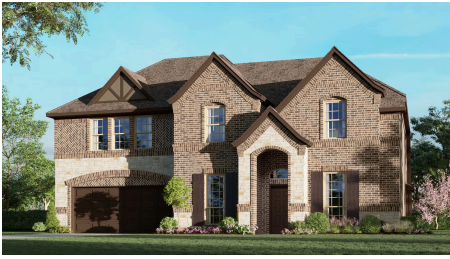
3135 A with Stone