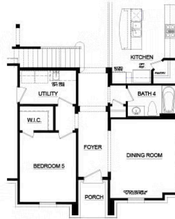
OPT. 5TH BEDROOM / BATH 4 ILO STUDY