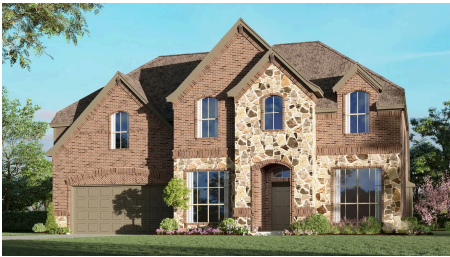
3135 D with Stone