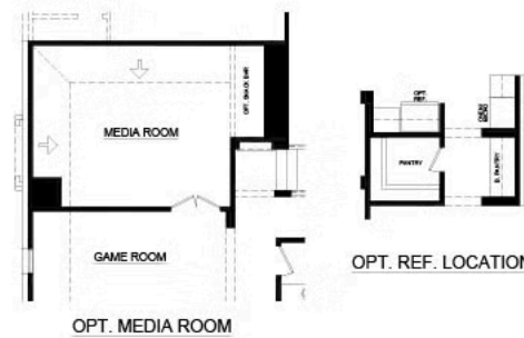
OPT. MEDIA ROOM