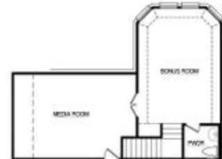
OPT. SECOND FLOOR BONUS ROOM W-MEDIA ROOM