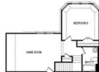
OPT. SECOND FLOOR BEDROOM #5 W-GAME ROOM