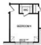
OPT. BEDROOM 4 I/O STUDY