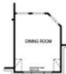
OPT. DINING ROOM I/O STUDY