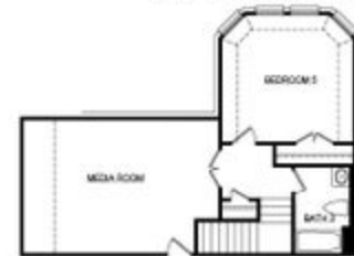
OPT. SECOND FLOOR BEDROOM #5 W-MEDIA ROOM