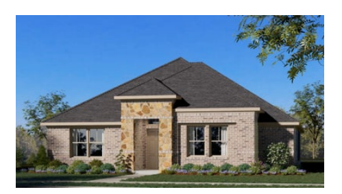
1578 A with Stone