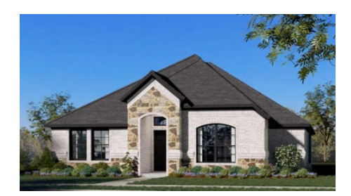
1568 C Stone