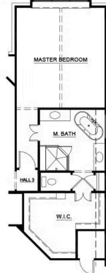
OPT. LUXURY MASTER BATHROOM