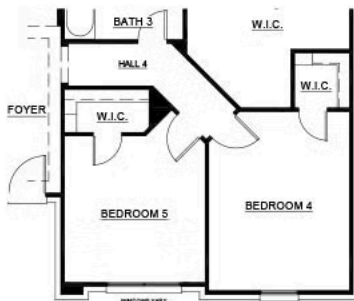
OPT. BEDROOM 5 ILO FLEX ROOM