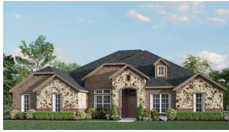
3009 A with Stone