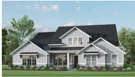
3009 D with Stone