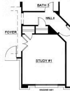
OPT. STUDY ILO FLEX ROOM