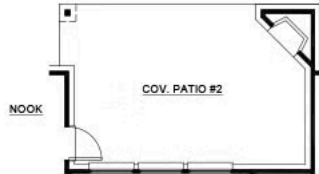
OPT. FIREPLACE AT COVERED PATIO #2