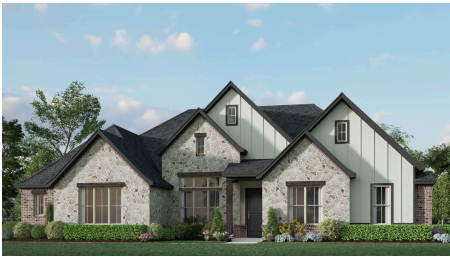
3009 B with Stone