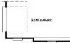
3RD CAR GARAGE