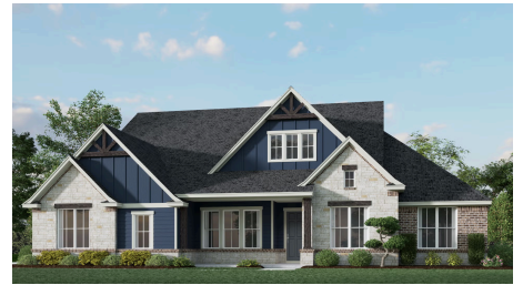
3009 C with Stone