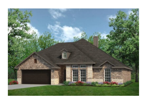
2393 B with Stone