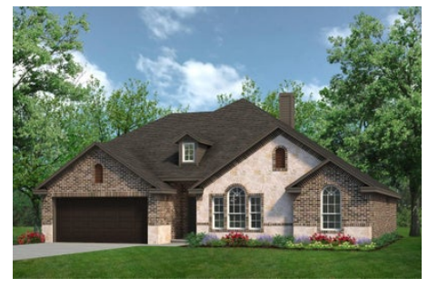
2393 A with Stone