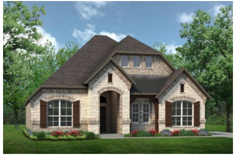
2373 C with Stone