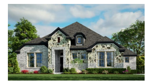
2373 A with Stone