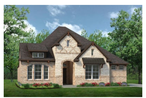
2373 B with Stone