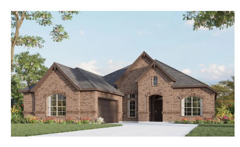
2050 A 2050 A with Stone 2050 B