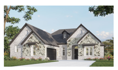
2050 B with Stone 2050 C 2050 C with Stone