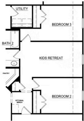
OPT. KIDS RETREAT ILO BEDROOM

4 Bedrooms Optional Fireplace 2 Full Baths Optional Kids Retreat Family Room Optional Study ILO Flex Room Dining Room Optional Covered Patio Nook Optional 24' Garage Flex Room Optional 3-Car Garage