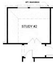
OPT. STUDY ILO FLEX ROOM