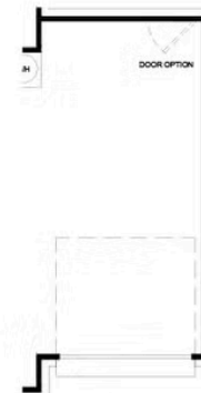
OPT. 3RD CAR GARAGE

In a continuing effort to improve our products and communities, Antares Homes may (in its sole and exclusive discretion and without creating any obligation or notice) abandon, change, or otherwise modify plans, pricing, included features, home site availability, terms, etc. All images, renderings, dimensions, depictions or descriptions of home designs and layouts being offered are for representational and informational purposes only and may vary from the homes being built or completed improvements. All dimensions and designs are subject to field variations and modifications. © 2020 Antares Homes.