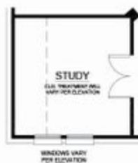
OPT. STUDY ILO FLEX ROOM