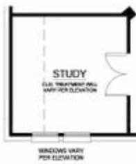
OPT. STUDY ILO FLEX ROOM