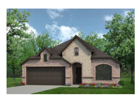
1912 B with Stone 1912 C 1912 C with Stone