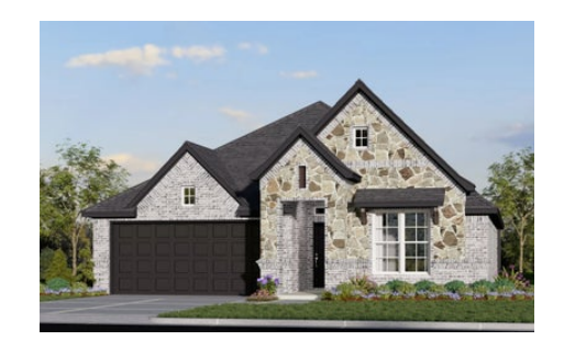
1912 D with Stone