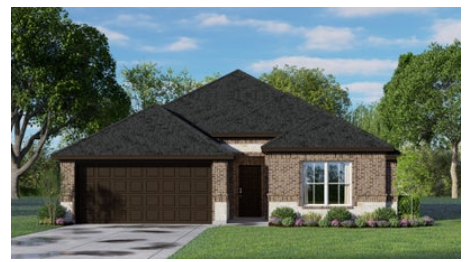
1660 A with Stone