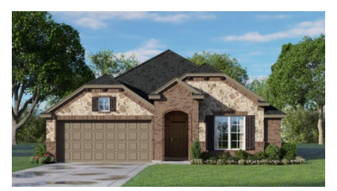
1660 C with Stone