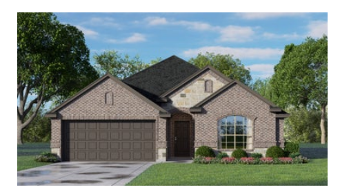
1660 B with Stone