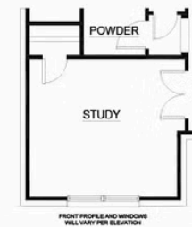
OPTIONAL STUDY ILO FLEX ROOM