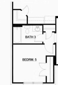
OPTIONAL BEDRM. 5 w/BATHROOM 3 ILO FLEX ROOM w/POWDER