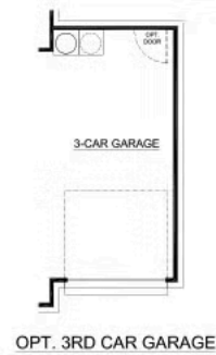
OPT. 3RD CAR GARAGE