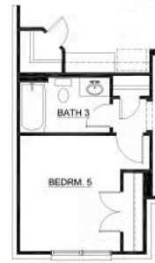
OPTIONAL BEDRM. 5 w/BATHROOM 3 ILO FLEX ROOM w/POWDER