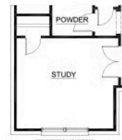
OPTIONAL STUDY ILO FLEX ROOM