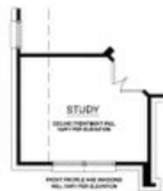
OPT. STUDY ILO FLEX