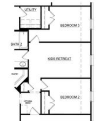
OPT. KIDS RETREAT ILO BEDROOM

4 Bedrooms Optional Fireplace 2 Full Baths Optional Kids Retreat Family Room Optional Study ILO Flex Room Dining Room Optional Covered Patio Nook Optional 24' Garage Flex Room Optional 3-Car Garage