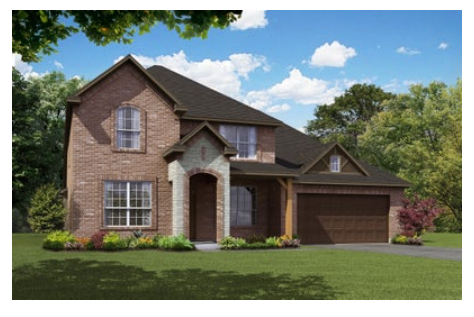
3218 A with Stone