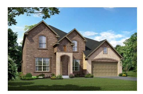
3218 C with Stone