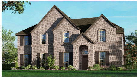
3135 A with Outswing