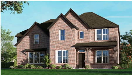
3135 B with Outswing