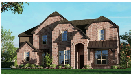
3135 C with Outswing