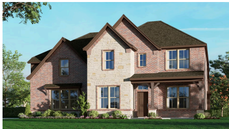
3135 B with Outswing Stone