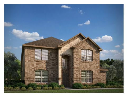
3106 A with Stone