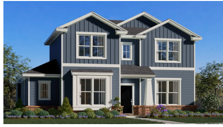
3106 C A