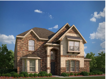
3106 C with Stone