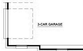
3RD CAR GARAGE