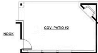
OPT. FIREPLACE AT COVERED PATIO #2