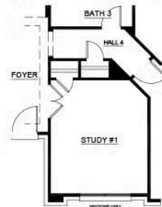
OPT. STUDY ILO FLEX ROOM