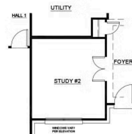
OPT. STUDY ILO DINING