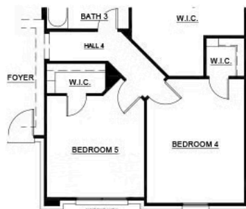
OPT. BEDROOM 5 ILO FLEX ROOM