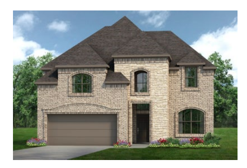
2844 B with Stone