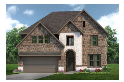
2844 C with Stone