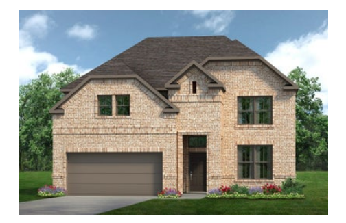
2844 A with Stone