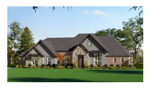
2797 B with Stone