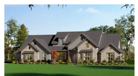
2797 C with Stone