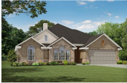
2379 A with Stone