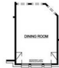
OPT. DINING ROOM IN LIEU OF STUDY