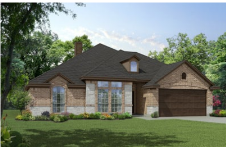
2379 B with Stone