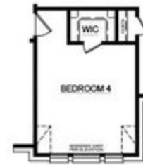
OPT. BEDROOM 4 IN LIEU OF STUDY