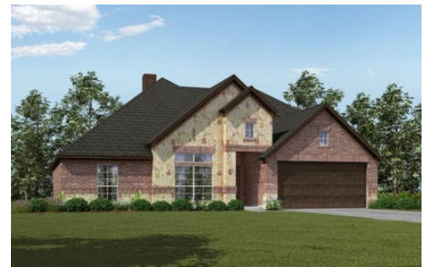
2379 C with Stone