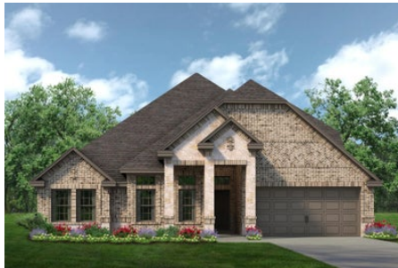
2379 E with Stone