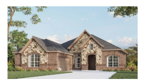
2050 B with Stone