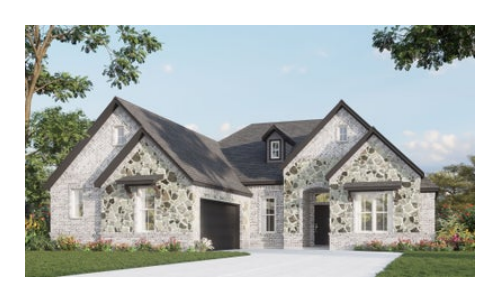
2050 C with Stone