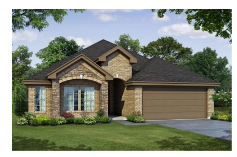
1730 C with Stone