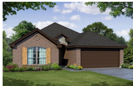
1730 A with Stone