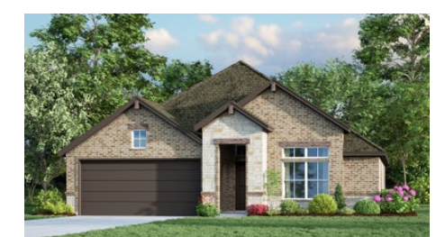
1730 E with Stone