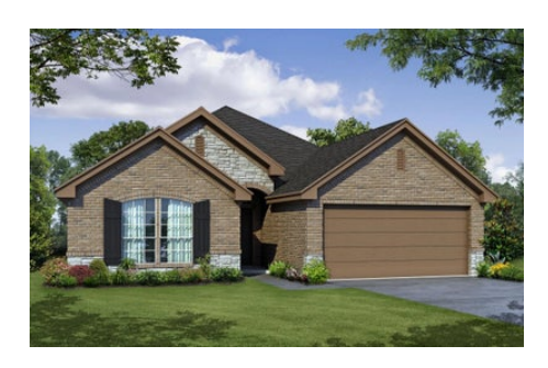
1730 B with Stone