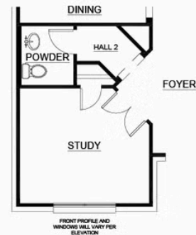
OPT. STUDY ILO FLEX