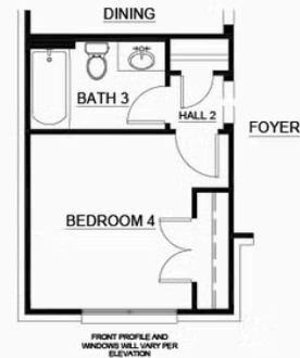
OPT. BEDROOM 4 W/ BATH 3 ILO FLEX W/ POWDER

In a continuing effort to improve our products and communities, Antares Homes may (in its sole and exclusive discretion and without creating any obligation or notice) abandon, change, or otherwise modify plans, pricing, included features, home site availability, terms, etc. All images, renderings, dimensions, depictions or descriptions of home designs and layouts being offered are for representational and informational purposes only and may vary from the homes being built or completed improvements. All dimensions and designs are subject to field variations and modifications. © 2021 Antares Homes.