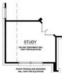
OPT. STUDY ILO FLEX