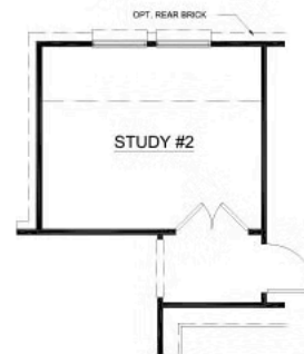
OPT. STUDY#2 ILO FLEX ROOM