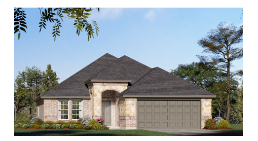
1849 A with Stone