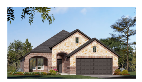
1849 C with Stone