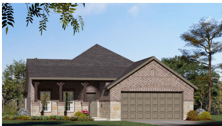
1849 B with Stone