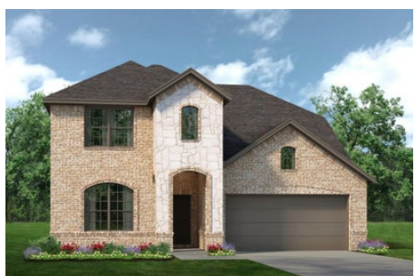
2440 A with Stone