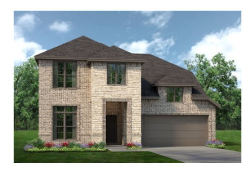
2440 B with Stone