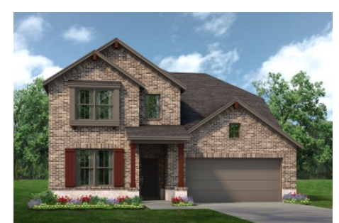
2440 C with Stone