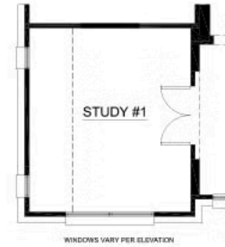
OPT. STUDY#1 ILO DINING