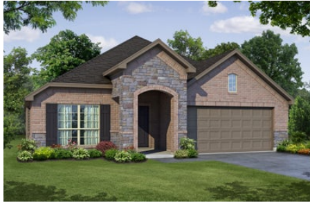
2065 A with Stone