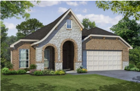
2065 B with Stone