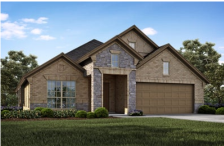
2065 D with Stone