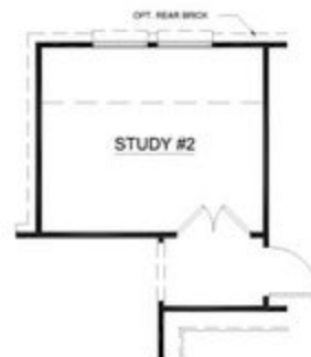
OPT. STUDY#2 ILO FLEX ROOM