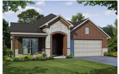
2065 C with Stone