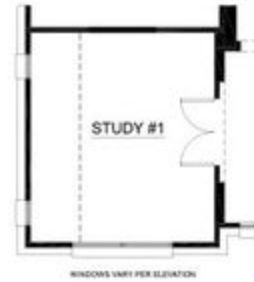
OPT. STUDY#1 ILO DINING