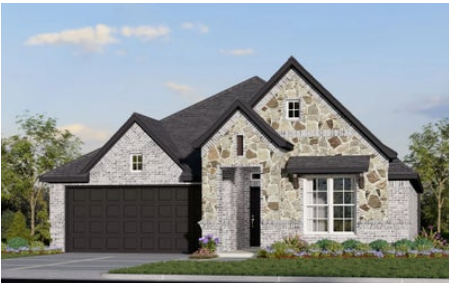
1912 D with Stone