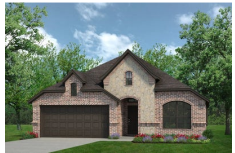
1912 C with Stone