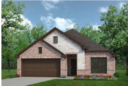
1912 A with Stone