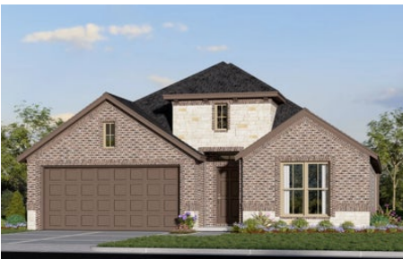
1912 B with Stone